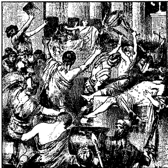
Conflict between patricians and plebeians in the Roman Republic

Over time, patricians began to resent Etruscan rule and to demand more political power in the government. In 509 B.C.E. they led a rebellion against the Etruscan monarchy, and overthrew the last king, Tarquinius Superbus (pronounced tar-KWIN-ee-uss soo-PER-buss), also known as Tarquinius the Proud. Patricians then established a new form of government, known as a republic , whose primary purpose was to serve the people. The word republic is derived from the Latin term res publica , which translates as “the affairs of the people.” They also divided the state’s power to prevent any single person from abusing it. Instead of a king, a body of 300 men, called the Senate , was elected to run the country. Senators served for life and were expected to make laws, appoint officials, and serve as judges. The Senate also selected two leaders, or Consuls , to command the army and run the day-to-day affairs of Rome.