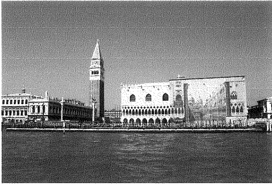
The Doge Palace

Venice also had a “ Secret Council of Ten ”. This council had the power to imprison, torture, and execute any citizens of Venice all in secret.