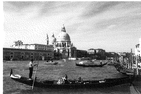
St. Mark's & Gondolas