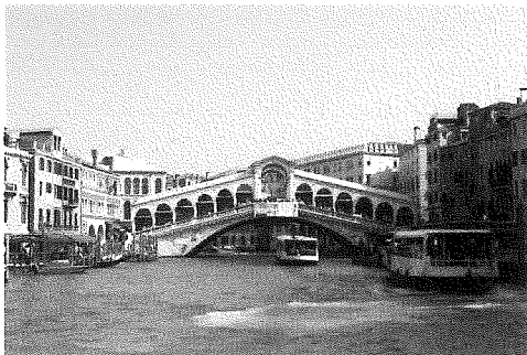
The Grande Canal

Titian also painted people and often painted women with light red hair. The colour is still known today as “ Titian Red ”.